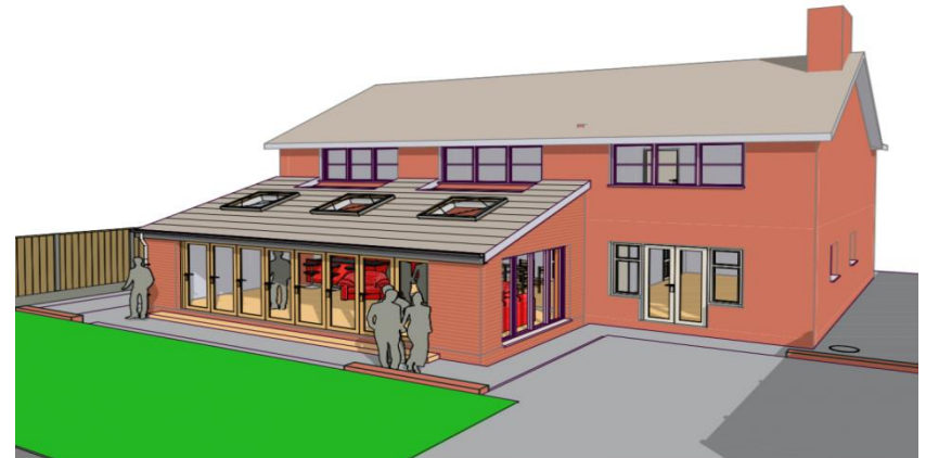
extend a house