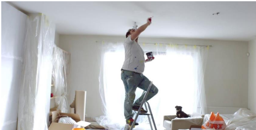
do up a house