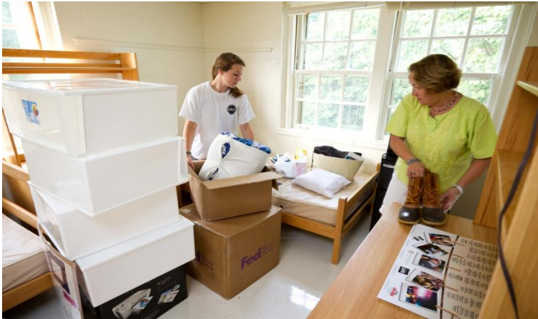
move in/out a house