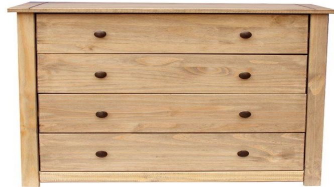
chest of drawers