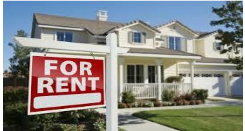
rent a house